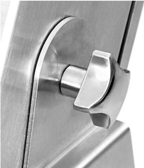
STAINLESS steel inclination adjustment system