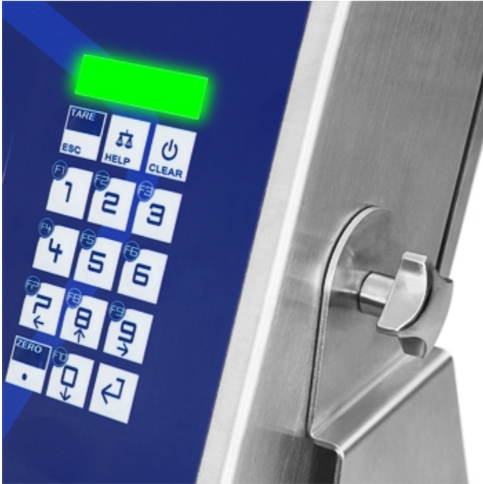
High brightness LED crosslight and mechanical keyboard.