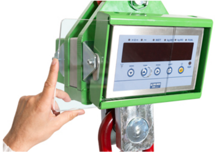
Protective screen in plexiglas for display and keyboard.