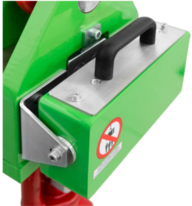
Fitted with extractable rechargeable battery pack.