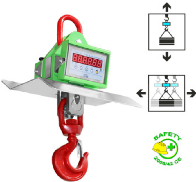
MCWHU with optional ring, swivelling hook and thermal shield