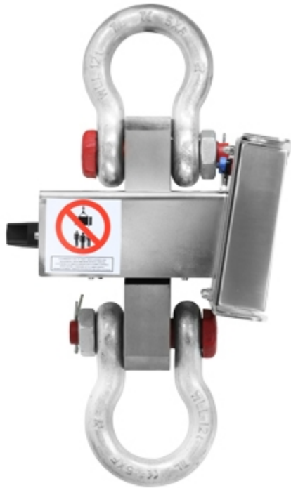
Crane scale MCW09: side view