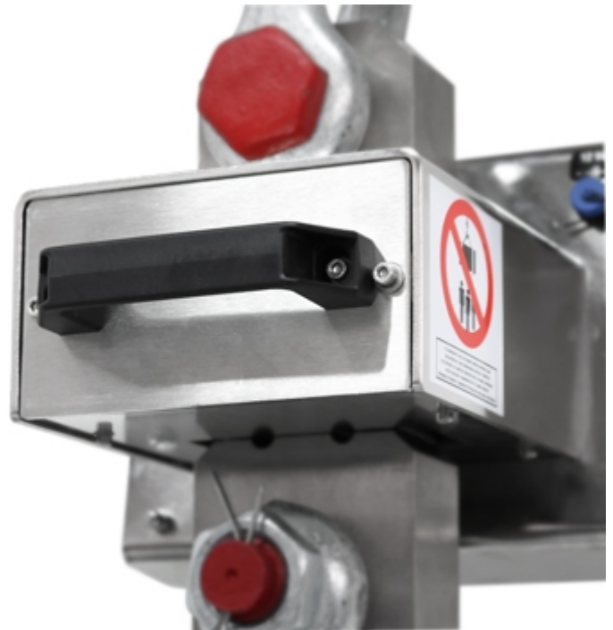
Crane scale MCW09: extractable battery view