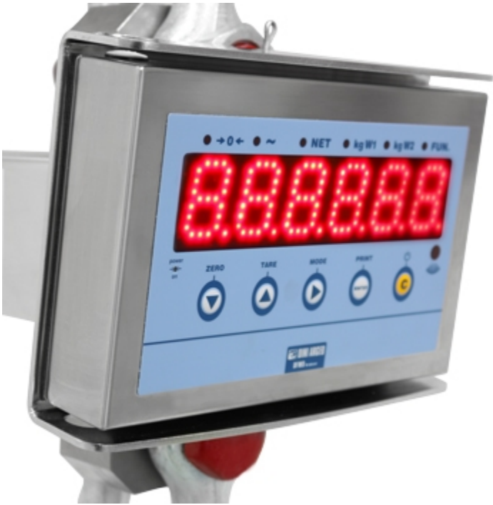
Crane scale MCW09: extra-bright 40mm display